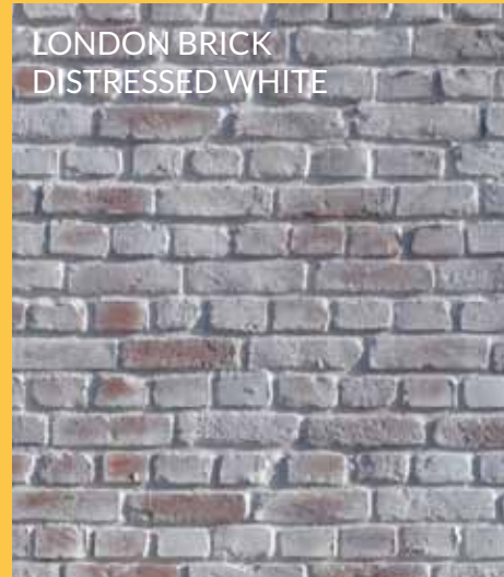
LONDON BRICK DISTRESSED WHITE