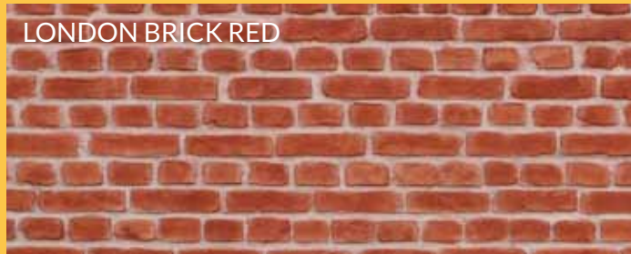
LONDON BRICK RED