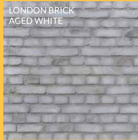
LONDON BRICK AGED WHITE