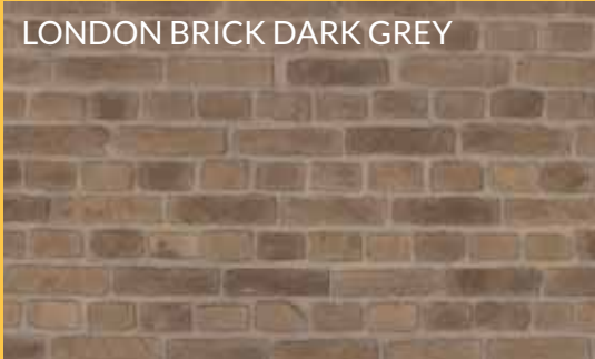
LONDON BRICK DARK GREY